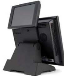
8" Rear LCD