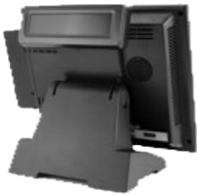
2 x 20 VFD