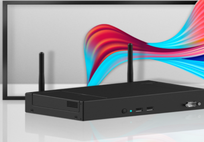
Supercharged Digital Signage Box PC 4K HDMI Output